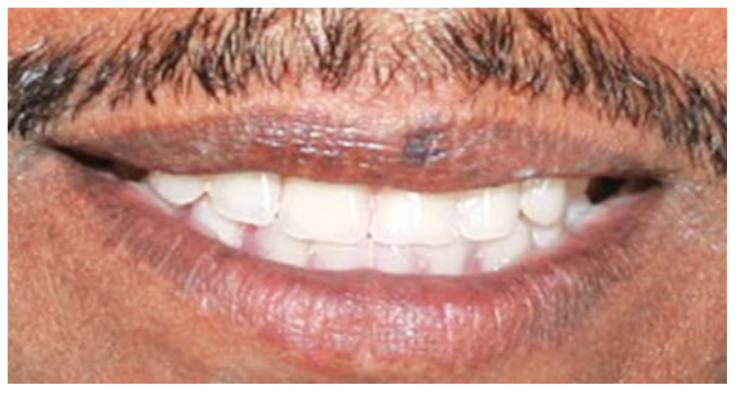
Fig. 4: After insertion