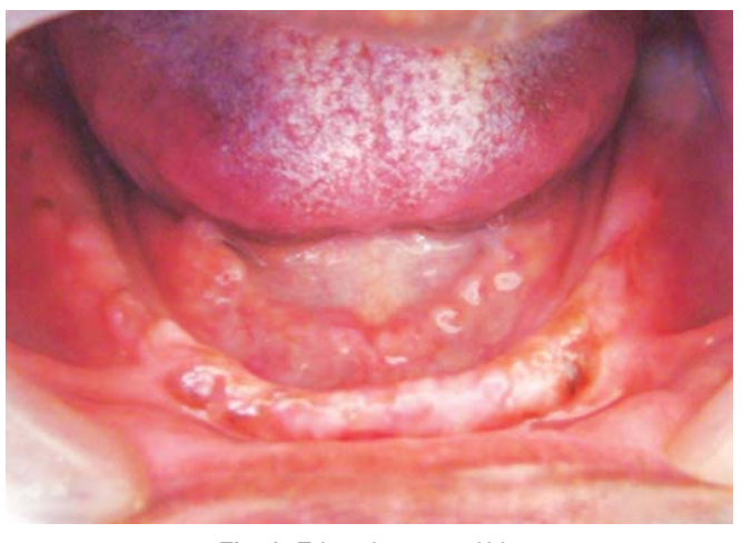
Fig. 1: Edentulous mandible

After patient selection (Fig. 1), an orthopantomogram (OPG) (Fig. 5) and lateral cephalogram were taken. Radiographic evaluation of surgical site in terms of bone volume, density and height was done. Appropriate implant sites, the number of implants, their length and angulations were decided. The implants should be placed approximately 5 to