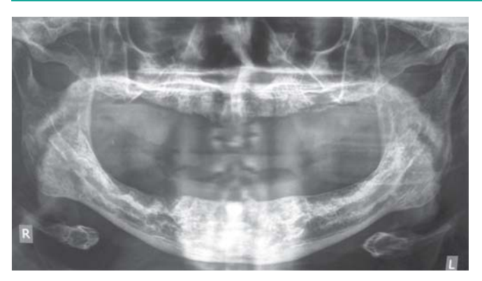
Fig. 5: Preoperative orthopantomogram