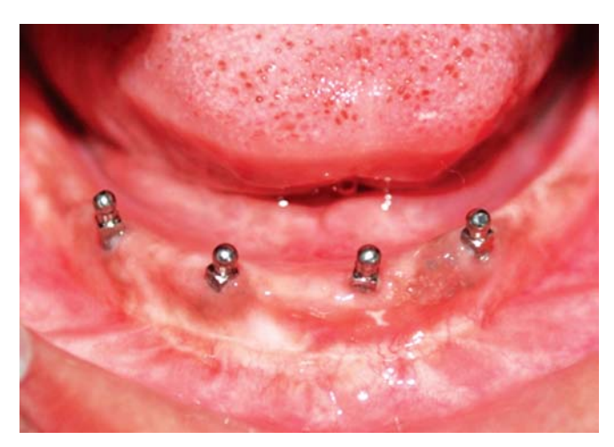
Fig. 7: Implant position in oral cavity

The patient wanted an immediate prosthesis after placement of implants. Maxillary and mandibular dentures were fabricated and delivered before implant surgery. After implant placement, denture was modified and adapted to the ball head of the MDI implants.