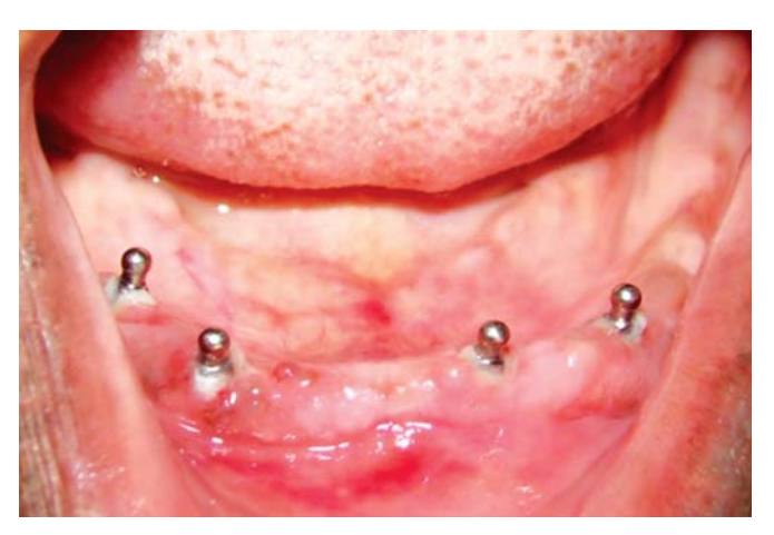
Fig. 2: Implant placed in position

A 52-year-old male patient reported with favorable edentulous maxilla and unfavorable edentulous mandible.