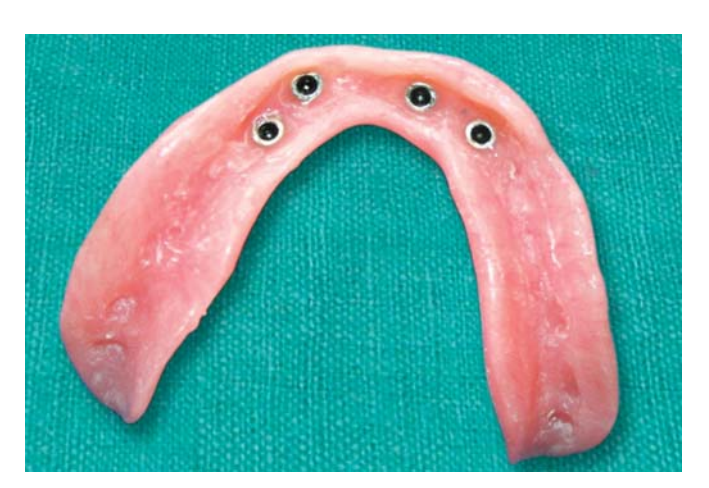
Fig. 3: Metal housings in mandibular denture