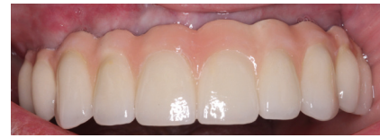
Figure 8: Mini implant bridge 1 month post-op

with a Water Pik® and toothbrush. Upon removal of the modified denture, the oral cavity, implants, and prosthesis were free of debris. With this information, a treatment plan was formulated to place an additional three mini implants to support a 10-unit fixed partial denture 10-unit FPD (Evolution Dental Lab) (Figure 5).