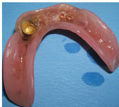
Figure 4: Prosthetic re-evaluation after 2 years