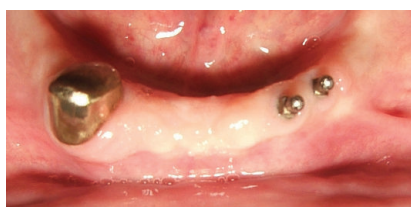
Figure 5: 2-year clinical re-evaluation