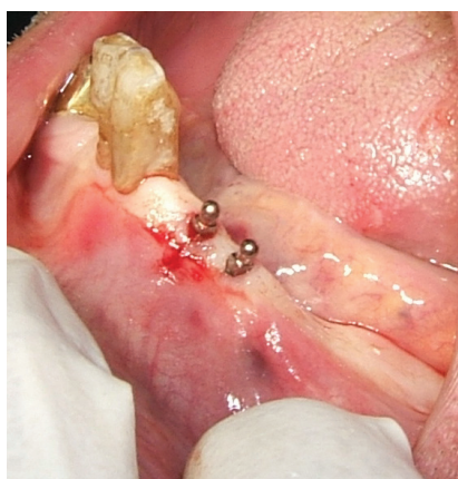
Figure 2: Mini implants placed, no bleeding