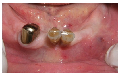
Figure 1: Initial situation, before surgery